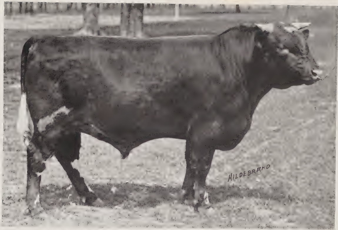
DIAMOND MARR 379691.